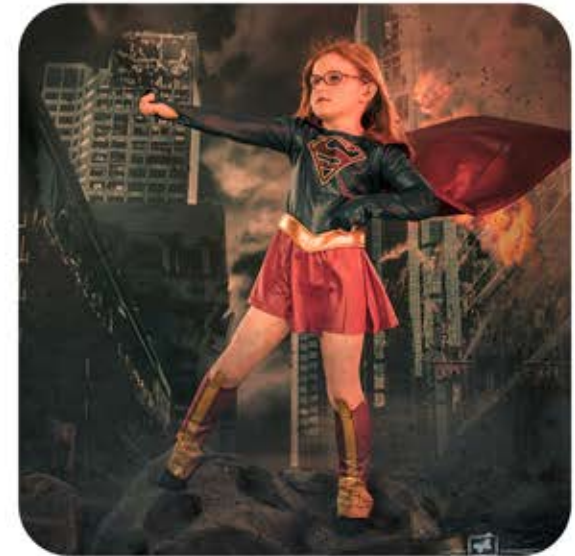
THE WIZARDING WORKSHOP

The Superhero Sessions are suitable for all ages from 0 to 99. Realistic props, movie style lighting and lots of fun. All costumes and accessories provided but cosplayers welcome to bring own costumes. Just €50 deposit to secure an appointment for up to 3 children. Packages from €275.